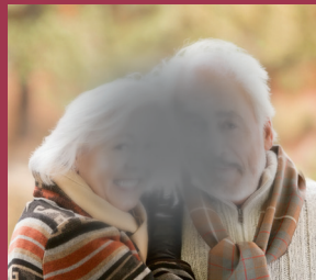
Advanced AMD causes significant visual field changes.