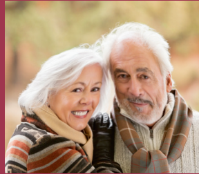
Early AMD vision changes may not be noticed, but may be detected with an OCT exam.